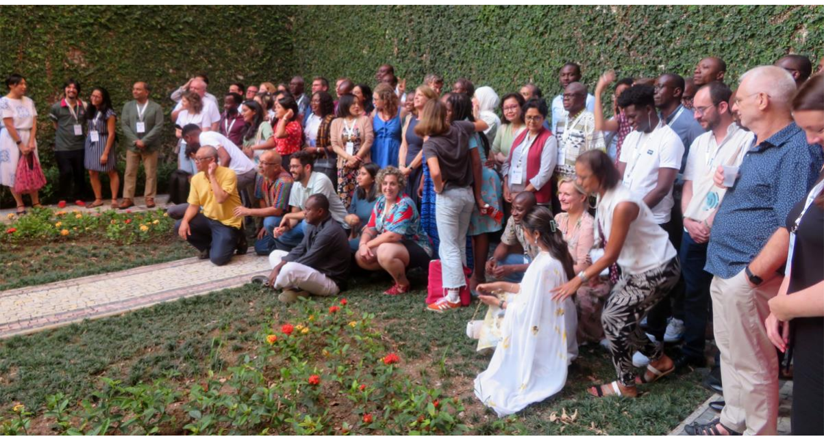
MIDEQ researchers gathered in Rio de Janeiro, September 2023

knowledge into policies and practices.<sup>i</sup> Our focus here is to explore ways through which migrants themselves were involved in and shaped our own work, and building on this to suggest good practices that other researchers might draw on in the future to ensure that rhetoric about participatory processes may better be turned into reality.<sup>ii</sup>