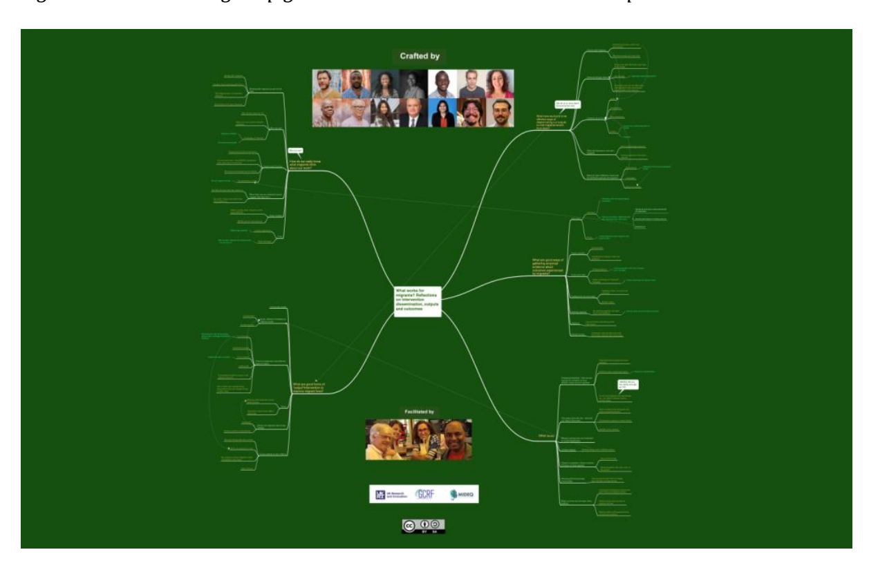
Figure 2: Ideas-sharing map generated at the roundtable workshop

ideas onto a mind map, projected onto a wall so that it was visible to all. This enabled participants to see and reflect on what was being said at the time it was being discussed, which in turn prompted further conversations. Again, together with all participants in the workshop, we then sought to identify the five or six main issues that were most pertinent for each of the four questions, and also included a further set of other issues that participants felt were important but lay outside the four broad questions we had proposed at the beginning. After the workshop, we tidied up the ideas-sharing map (see Figure 2),xvi and it was distributed to all participants within 24 hours in case they wished to make any corrections or further suggestions while the ideas were fresh in their minds.